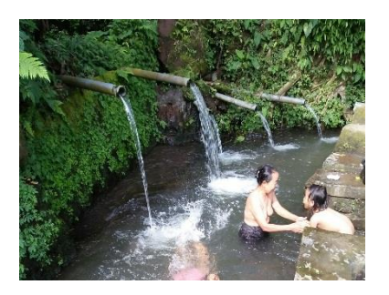
Figure 4. Purification Malukat ritual in the spring of Sudamala

Not only that, Sangkan Gunung Village also has the Bukit Tegeh, of a very steep set of stairs (moreless 350 steps) that offers tremendous views, a scenic river flowing through the valley floor and ample opportunity for both trekking. While other spots are more convenient, visitors can organize an ascent of Gunung Agung from Sideman and just more easy-going wanders through the rice fields.