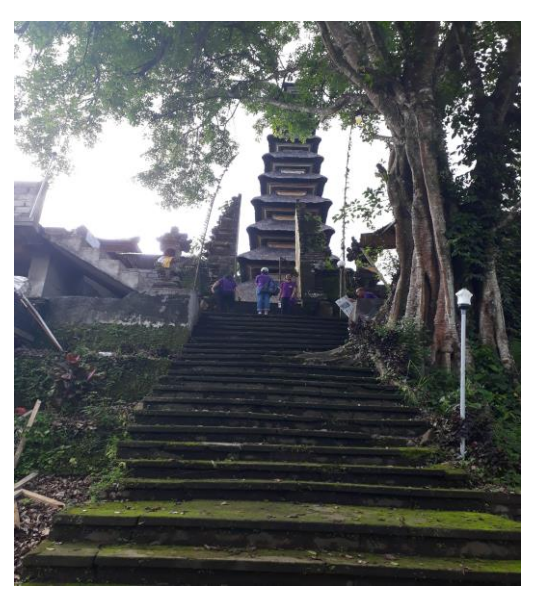
Figure 5. The Bukit Tegeh Temple surrounded by tropical forest and paddy fields

Not only that, Sangkan Gunung Village also has the Bukit Tegeh, of a very steep set of stairs (moreless 350 steps) that offers tremendous views, a scenic river flowing through the valley floor and ample opportunity for both trekking. While other spots are more convenient, visitors can organize an ascent of Gunung Agung from Sideman and just more easy-going wanders through the rice fields.