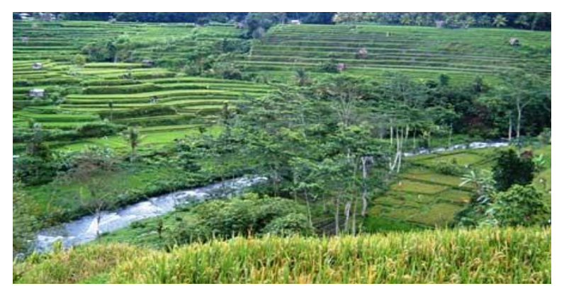
Figure 2. The view of paddy fields and Telaga Waja River

unmarked green gems is Sangkan Gunung Village. This village has a view of rice fields and Telaga Waja River as it is shown in figure 2.