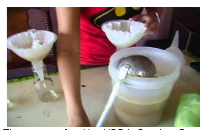
Figure 3. The process of making VCO in Sangkan Gunung Village

Another potential to be explored in Sangkan Gunung Village is the tour package for making VCO. So, tourists can follow the process of making VCO from the coconuts harvested on their trees in the village.